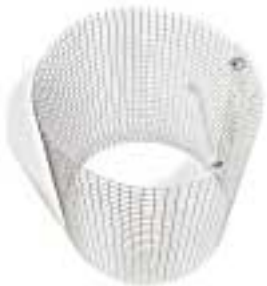
Chickenwire (or hardware cloth) and old wooden pallets make the basis for two easy-to-build compost bins.

Materials. Bins can be built from scrap lumber, old pallets, snow fence, chicken wire, or concrete blocks. Typically, several types of composting bins are sold at hardware or lawn and garden stores.